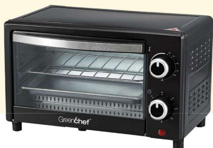
Oven, Toaster, Griller