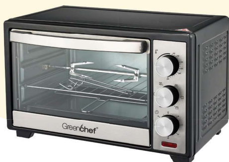
Oven, Toaster, Griller With ROTISSERIE & CONVECTION FUNCTION