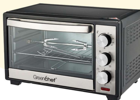
Oven, Toaster, Griller With ROTISSERIE & CONVECTION FUNCTION